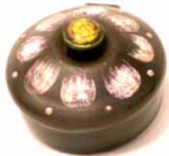
Lid after antiquing

©2004/2005 These designs may be used for personal study. Please request permission for teaching from the individual artist.