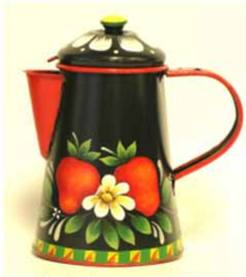
Pitcher before antiquing