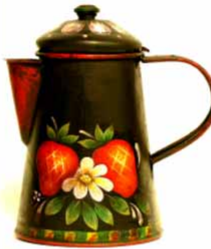
Pitcher after antiquing